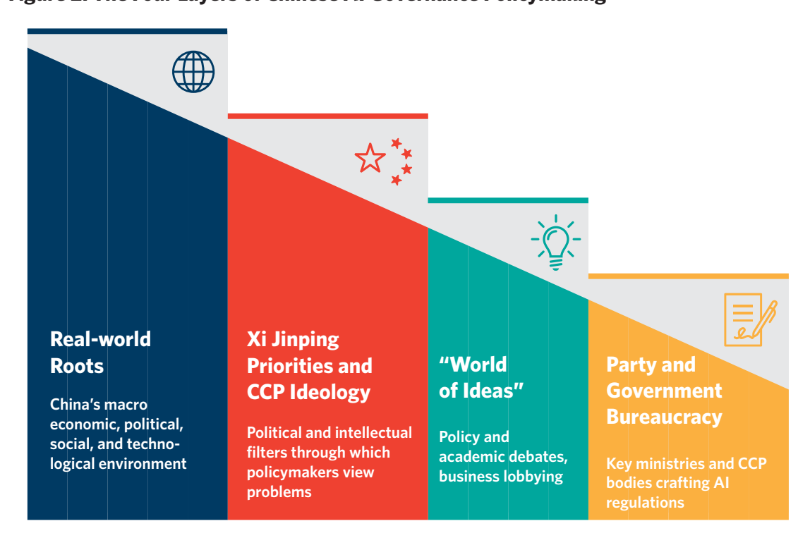
Figure 2. The Four Layers of Chinese AI Governance Policymaking

Chinese policy actors have even described the first-mover nature of their regulations as an added difficulty. When China began work on these regulations, the debates on the EU's AI Act were well underway in Europe, and Chinese policy analysts hoped that they could follow those debates and learn from the act. But slow progress on the AI Act meant that they had to forge ahead without the benefit of international guideposts or comparisons. For the United States, one benefit of its comparatively slow progress on AI governance is the opportunity to learn from regulatory experiments abroad—if policymakers are willing to take foreign regulations seriously.